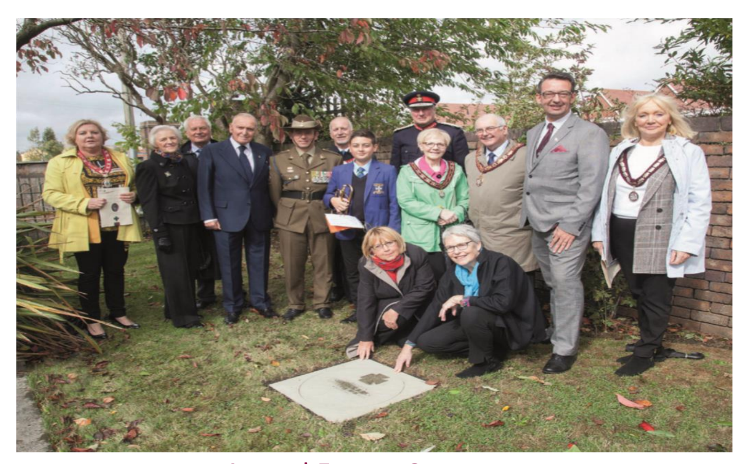
Armed Forces Covenant Flintshire County Council 7 May 2019